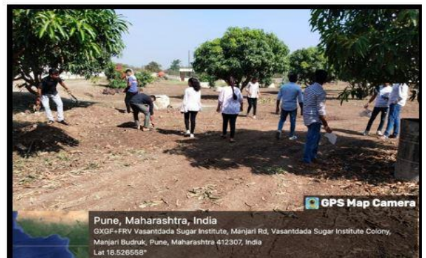
Involvement of teachers and students during the activity of Swachh Bharat Mission