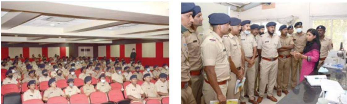
Faculties giving training to excise people who were part of the programme