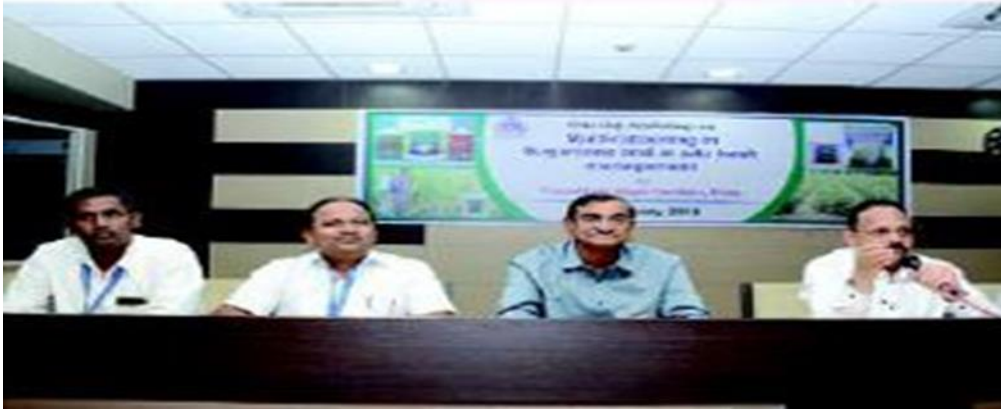
Questinaire section & discussion after the programme