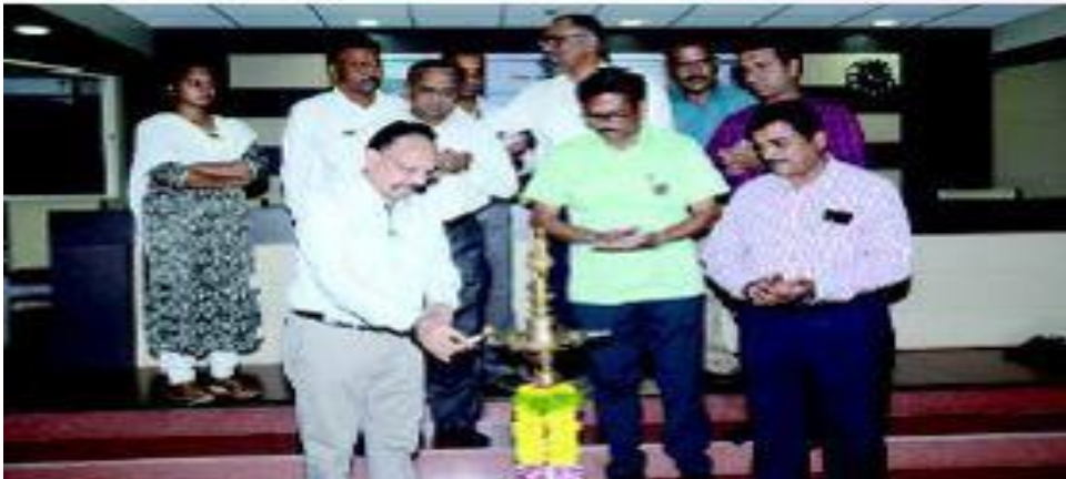
Lightning of the lamp by the guest during the inauguration of the programme on crop management under stress conditions