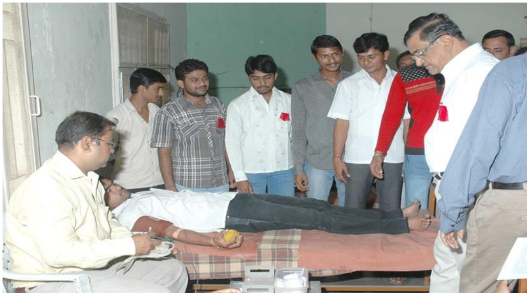
Director General, VSI taking feedback of the participants during health camp