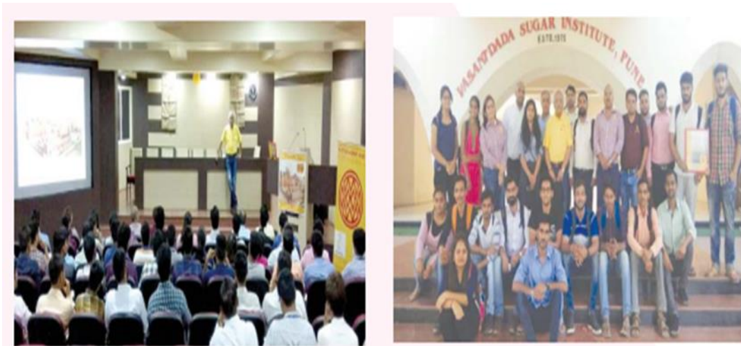
Seminar talk to students during the programme