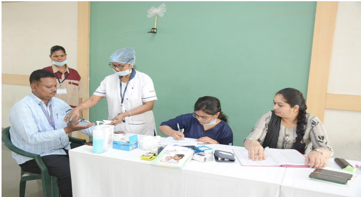
Nurse checking VSI staff before blood donation