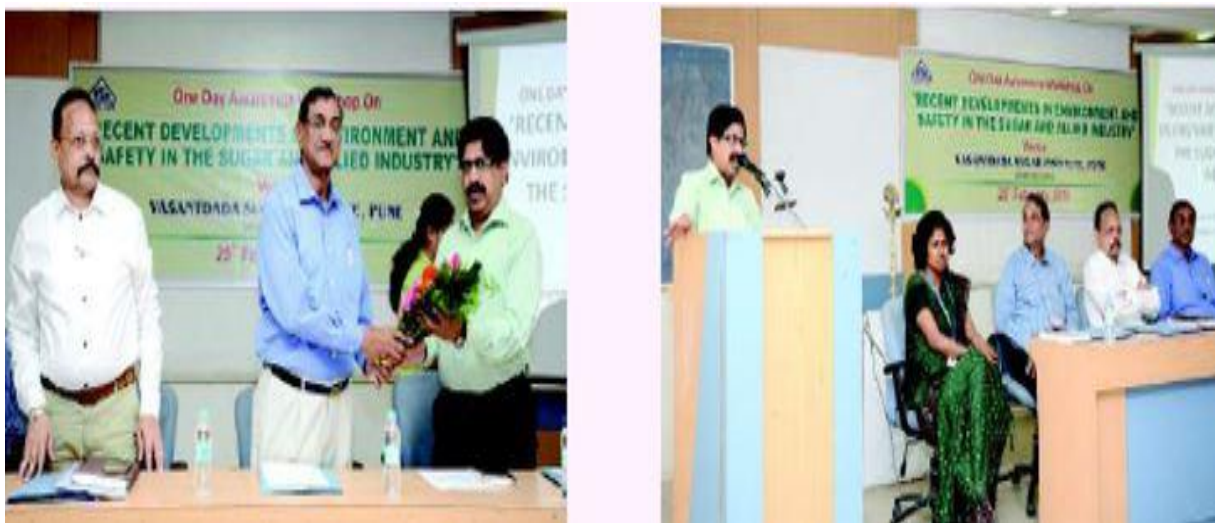
Welcome of the speaker and guest delivering their speech during the programme