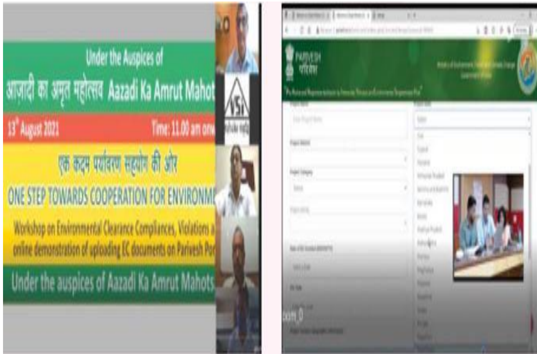
Talk during the programme of Aazadi Ka Amrut Mahotsav