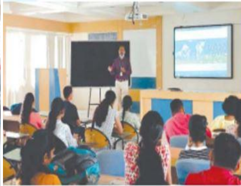
Lecture conducted during the awareness programme