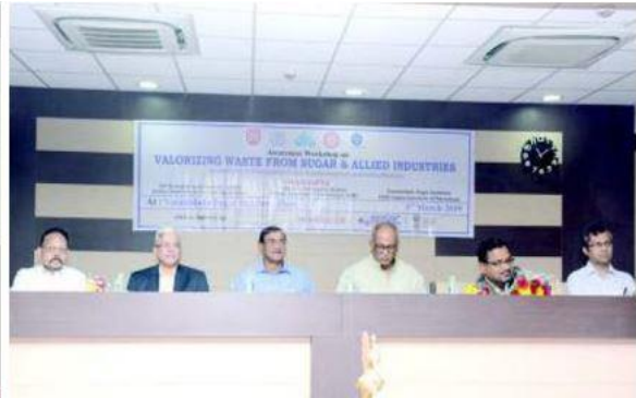
Lightning of lamp and opening of session during the programme and externa invited guests on the stage