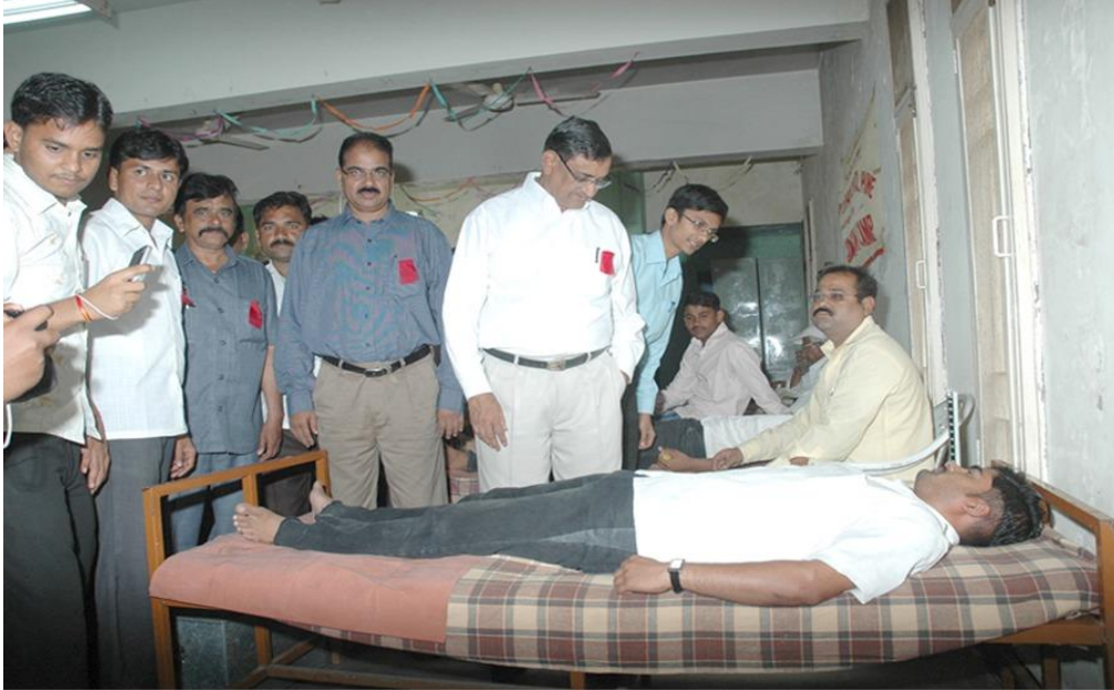
Visit of Director General & Principal VSI during visit of Health check-up