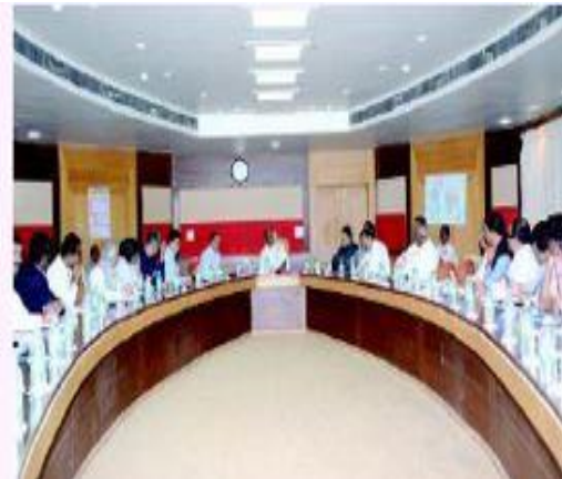
Meeting & discussion on economic yield of sugarcane & its by-products during the programme