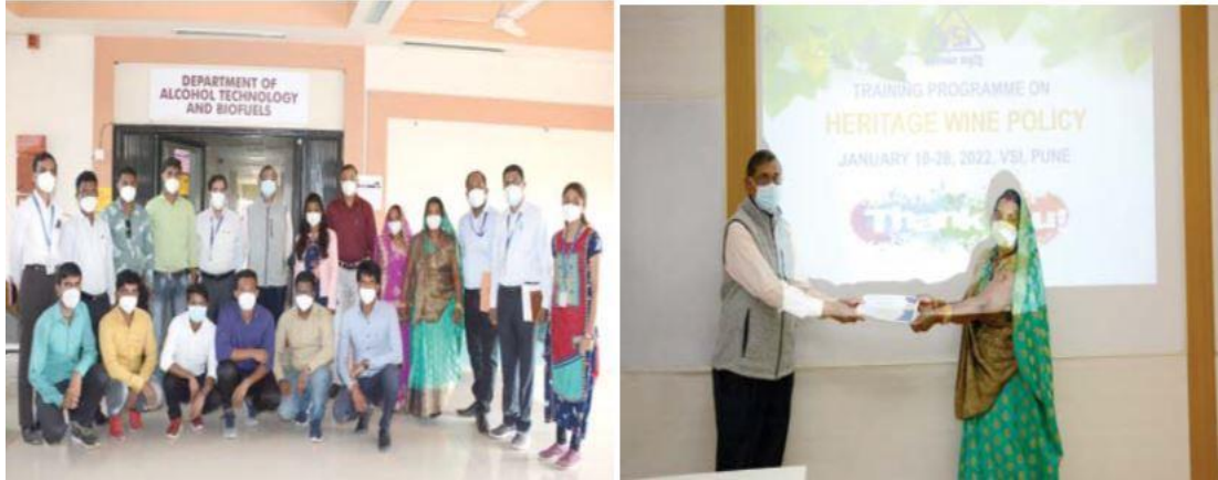
Group photo after the training programme & certificate distribution after the programme