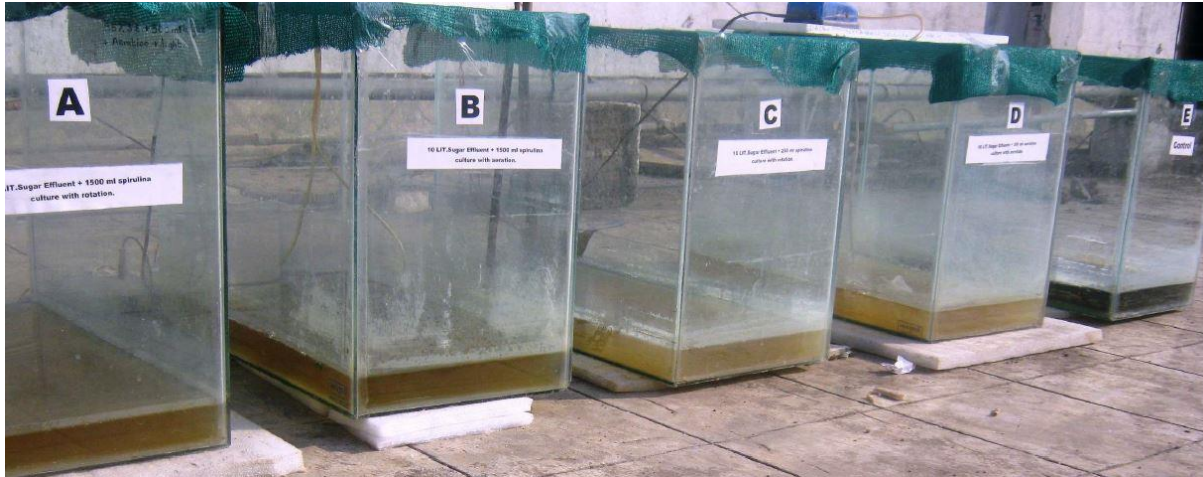
Treatment of industrial effluent using Open type bioreactor