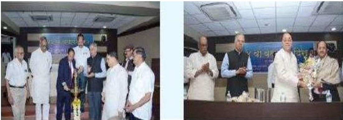
Inauguration of the programme & invited lectures to the students