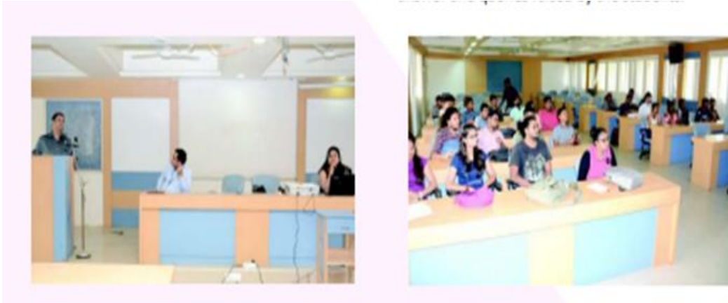
Seminar talk to students during the programme on United States of America work Experience Programme in Wine