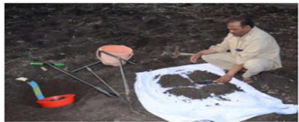
Involvement of students & faculties in the soil testing experiments