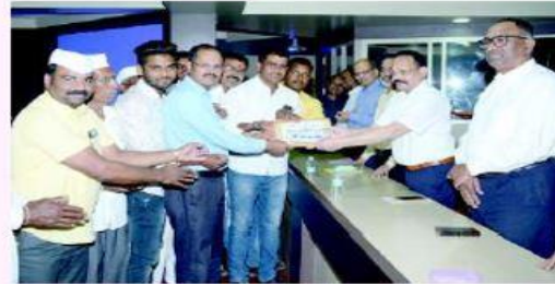
Lightning of the lamp and certificate distribution to farmers during the programme